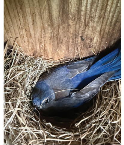
- Western Bluebird on the nest

Bonus bird/window interaction: Sometimes, especially during the spring and early summer when birds are breeding, male birds attack their own reflections in windows. While this type of window interaction is far less harmful than a collision, a battle with a window reflection can leave birds exhausted and weak (in addition to probably driving you bananas!). Try temporarily covering the mirror or window; this tends to be a temporary problem and he'll move on soon!