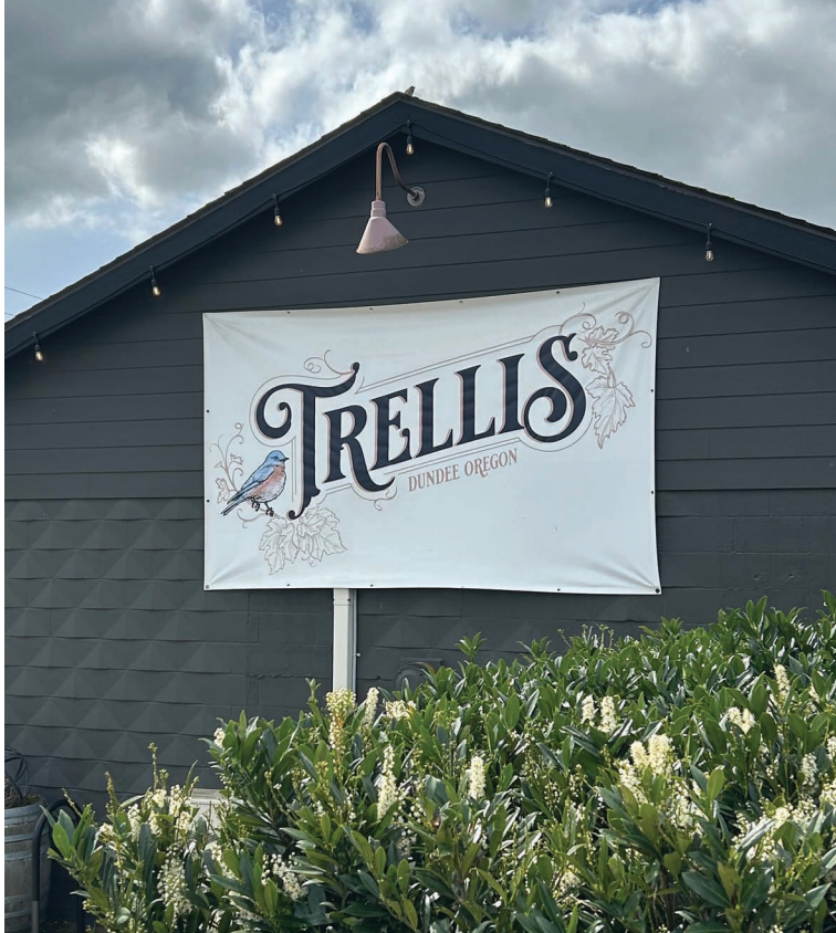
- Trellis Bistro in Dundee, Oregon