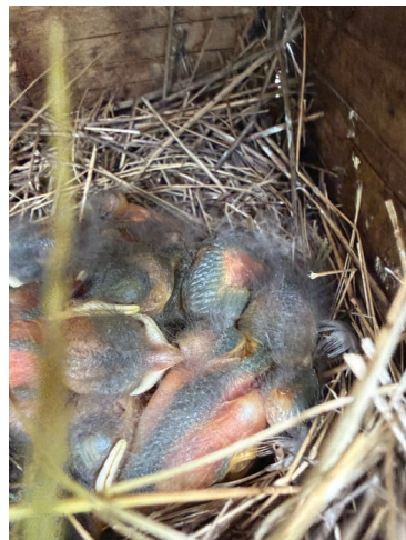
- Newly hatched nestlings

Both have been kind enough to show the new monitors the box locations and make some introductions to landowners. Thank you, all, for your love and commitment to the Western Bluebird. "May the bluebird of happiness light on your shoulder today".