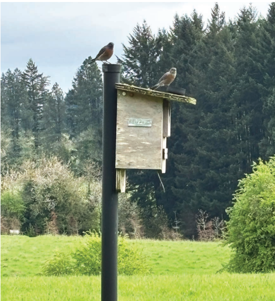
- Bluebird Pair at Luscher Farm

The Luscher Farm outing was a field trip in every sense. It's a fun, vast property to wander and one where you're more than likely to see our bluebird friends.