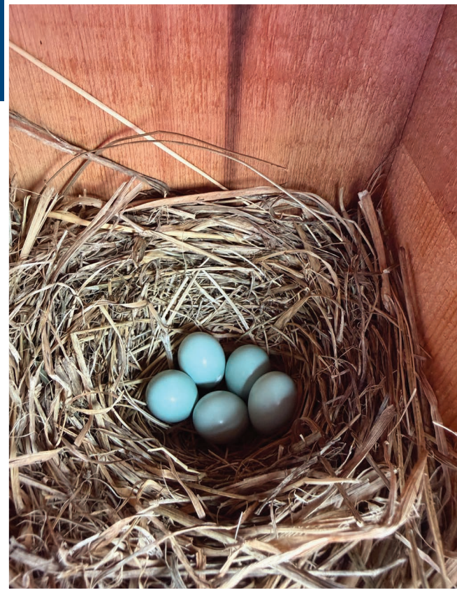
Look at the beautiful blue eggs!