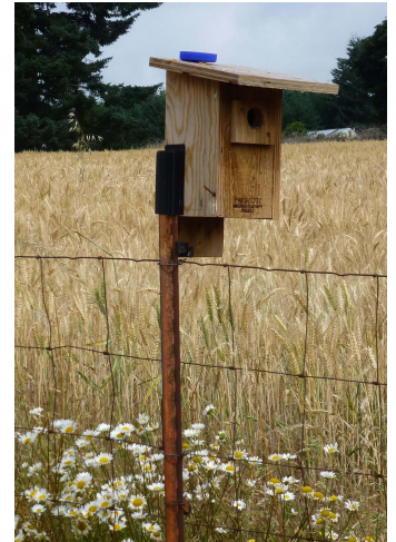
Unused nestbox that became home to 8 bluebird nestlings

Needless to say, this ultra-success in the nestbox I had helped build was a huge thrill for this first-year monitor momma!