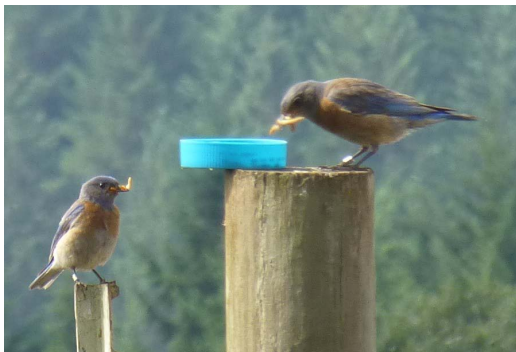
Western Bluebird pair collecting mealworms to feed nestlings